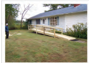
Did I do this or did I have help!