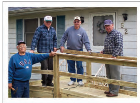
Somebody has to take the Picture