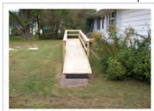
Clean up the Yard... Please!