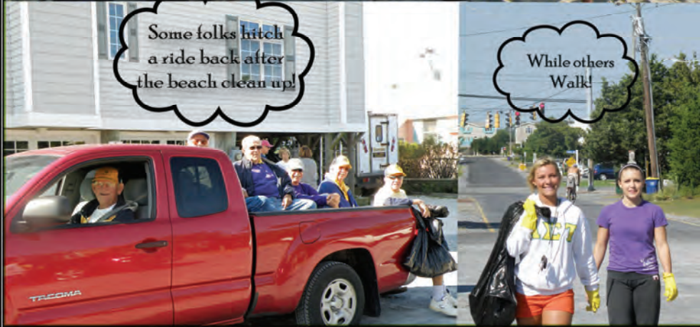
Ten Fenwick Island Lions, twelve Leos (and their faithful advisor) and a dog named "Bo" turned out to participate in Delaware's "Coastal Cleanup 2009" effort on Saturday, September 19th.