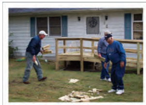
Yes Virginia... we do work hard!

The lady we built this ramp for actually used it before we finished due to her health. Submitted by, PP Sam.