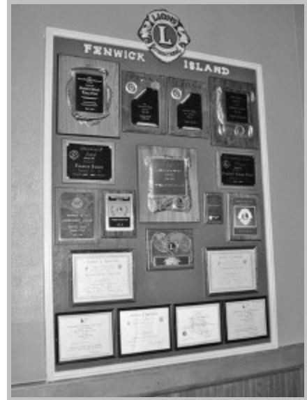
Final installation looks really nice!