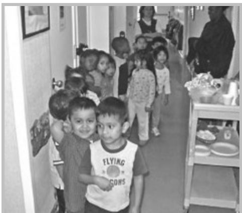
Pre School 4th graders line up waiting their turn for eye screening. They are always eager and a little bit nervous.

There is a tremendous amount of satisfaction in this program which provides a free service to kids who might not otherwise learn of eye problems until much later in life, if at all. We Serve!!!