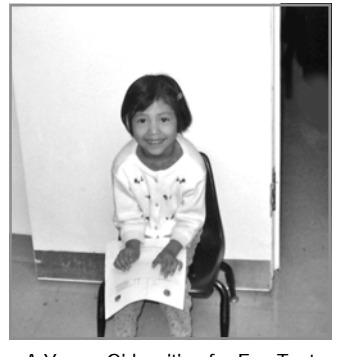
A Young Girl waiting for Eye Test