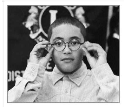
A young boy receives glasses courtesy of the LCIF SightFirst Program

It is anticipated that well over 1,000 children will be screened this Fall and many volunteer man-hours will be devoted to this essential and worthwhile community-based vision saving program.