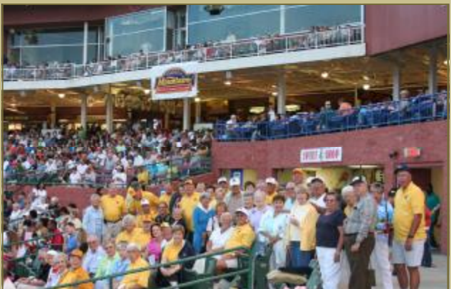
What a gang!!! Baseball and Fireworks... the way we like'm

Well... wasn't that a hot summer... by gore! Pun intended. Your Board has had a very busy summer this year and we expect all of our Club members have as well, in spite of the heat. So far, we have finished the Club schedule of Events, Committee assignments and made other important decisions but more importantly, we've even had time for some fun!