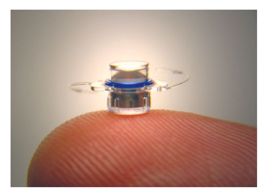
Functioning as a magnifying lens, the tiny IMT™ is placed directly into an eye.

Medicare covers the treatment for patients who meet certain physical requirements and are over the age of 65. Many people who have AMD will not qualify for the device. Many AMD patients have had cataract surgery, and cataract patients cannot receive the device because of certain physical and surgical dangers. The rehab process also is rigorous. Learning to use the device can take up to two years. The treatment is available at more than 100 eye care centers in the United States.