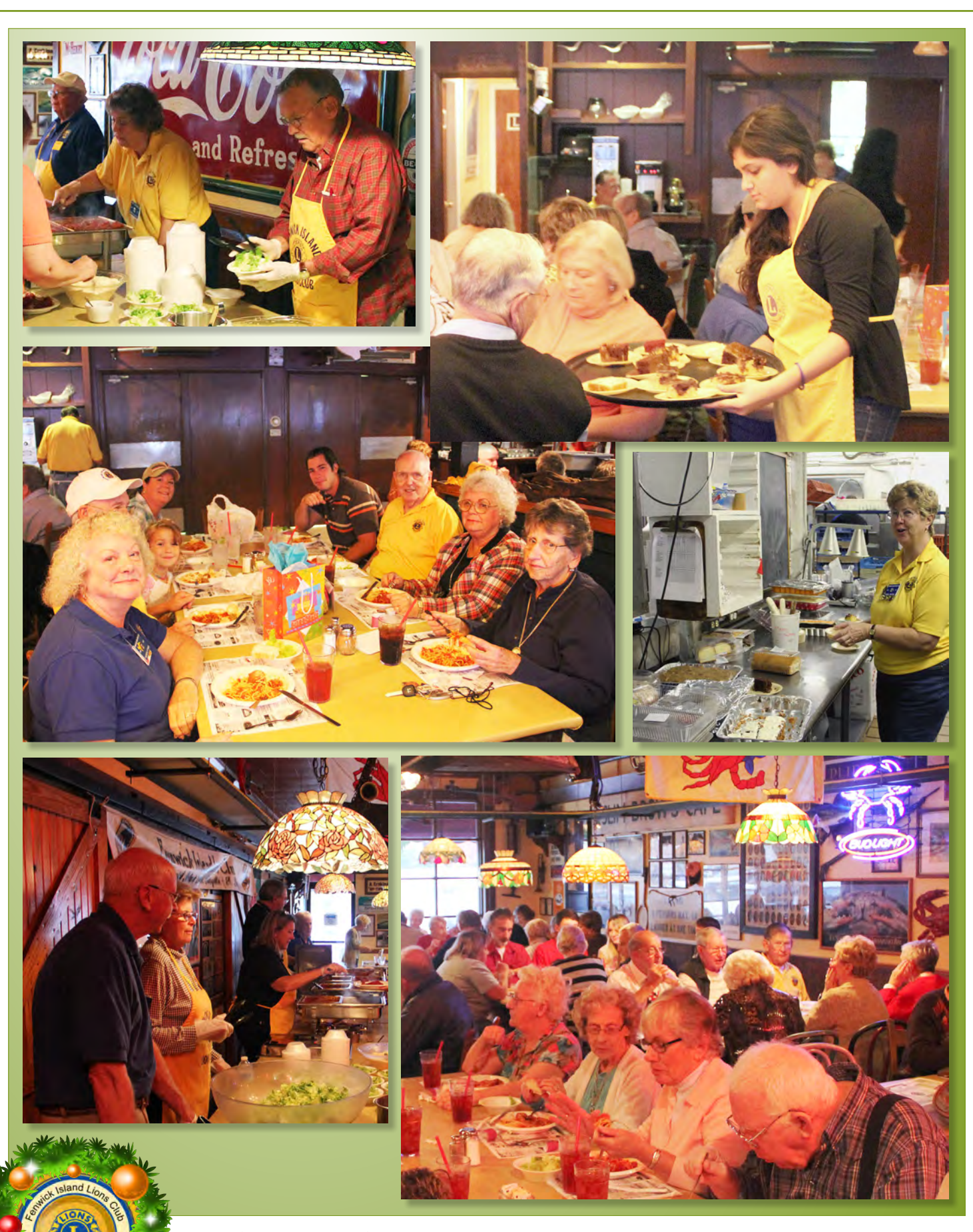
We Care. We Serve. We Accomplish. And, We can all be very Proud!