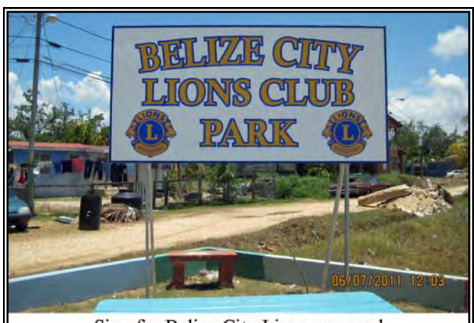
Sign for Belize City Lions new park